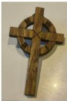
MWiB Cross pin badge £2