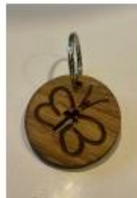
Round Butterfly keyring £2