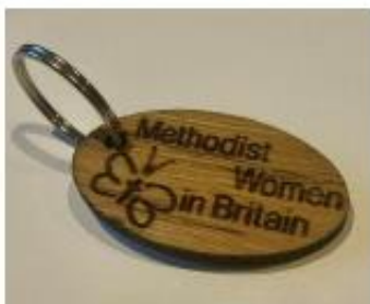
Oval MWiB keyring £2