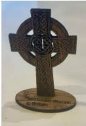
Celtic Cross on base with wording Methodist Women in Britain £5