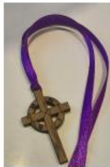
MWiB Cross bookmark £2