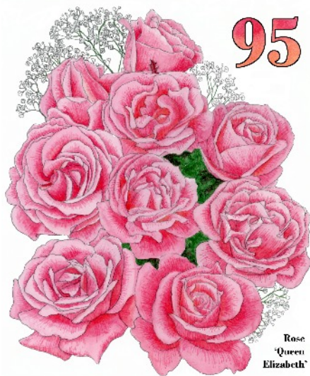
Rose 'Queen Elizabeth'