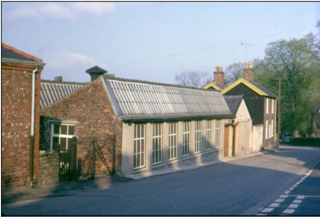
Langley Mill 1972

The picture and following details of the early history of the Mill and Williams Terrace are from Thelma Whiston's book "Langley Now and Then" published in 2008. The book is now out of print but many people in the area have copies.