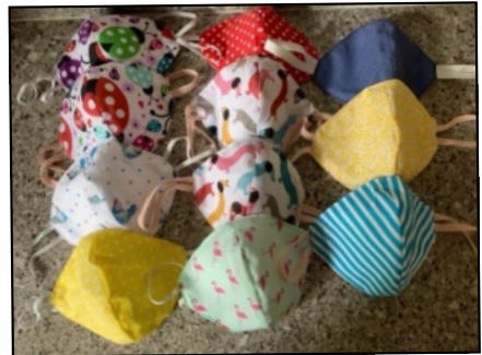
The finished masks