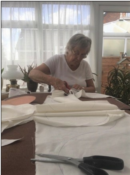
Grandma at work