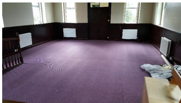
New carpet fitted