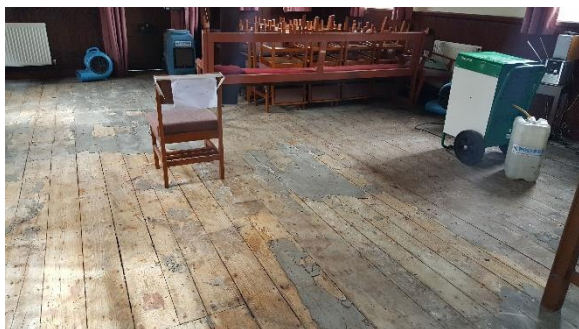
After the flood

We were planning to have the chairs cleaned and setup in the worship area and arrange a working party to clean the kitchen and toilets etc. with a view to being back at Green Close for Easter. Like everything else the plans are now on hold and we can only wait until the coronavirus epidemic is over before we can return to Green Close.